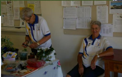
Some Workers, Bowlers and lots of laughs and fun!